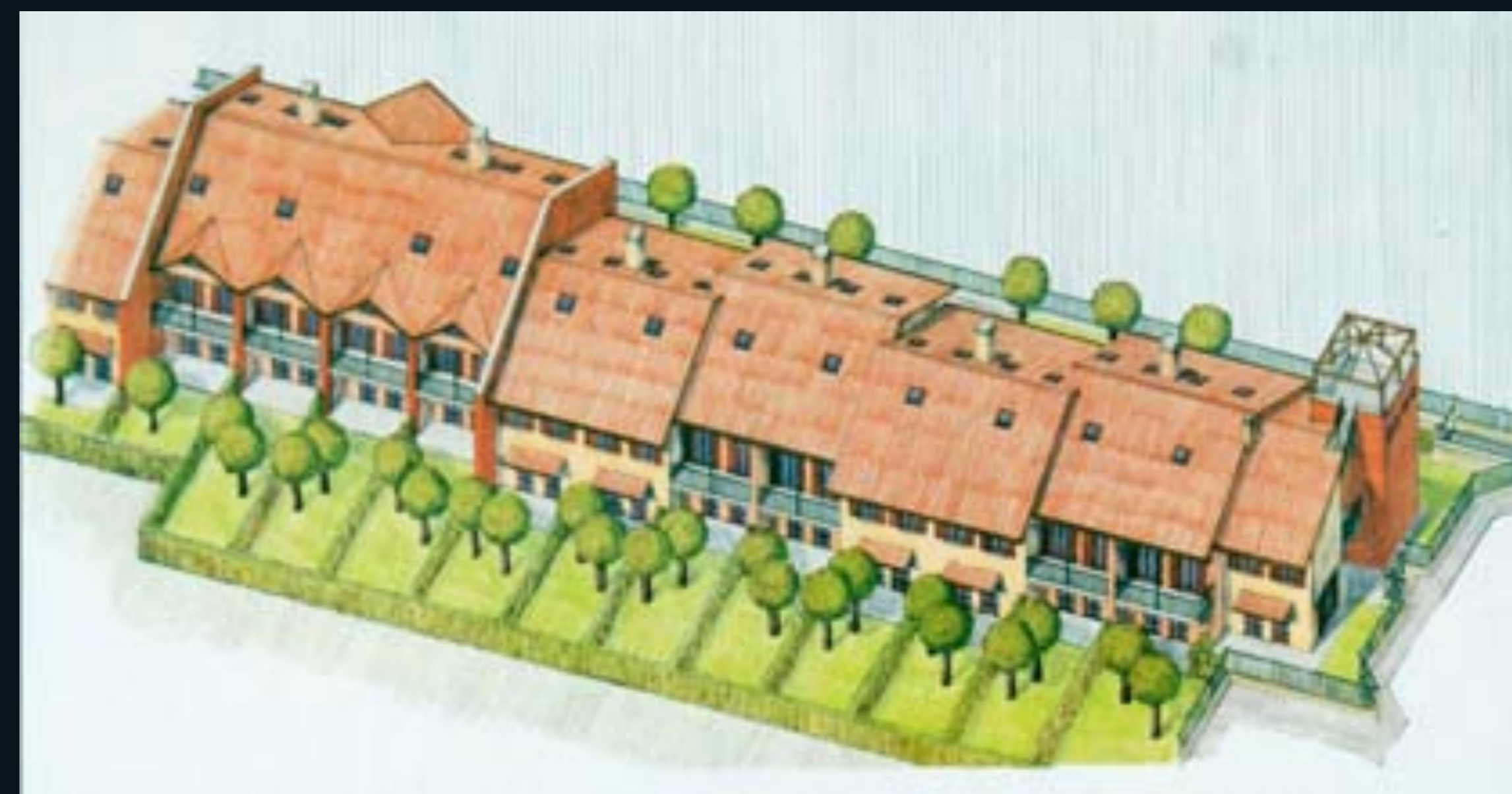
Vista assonometrica lato est