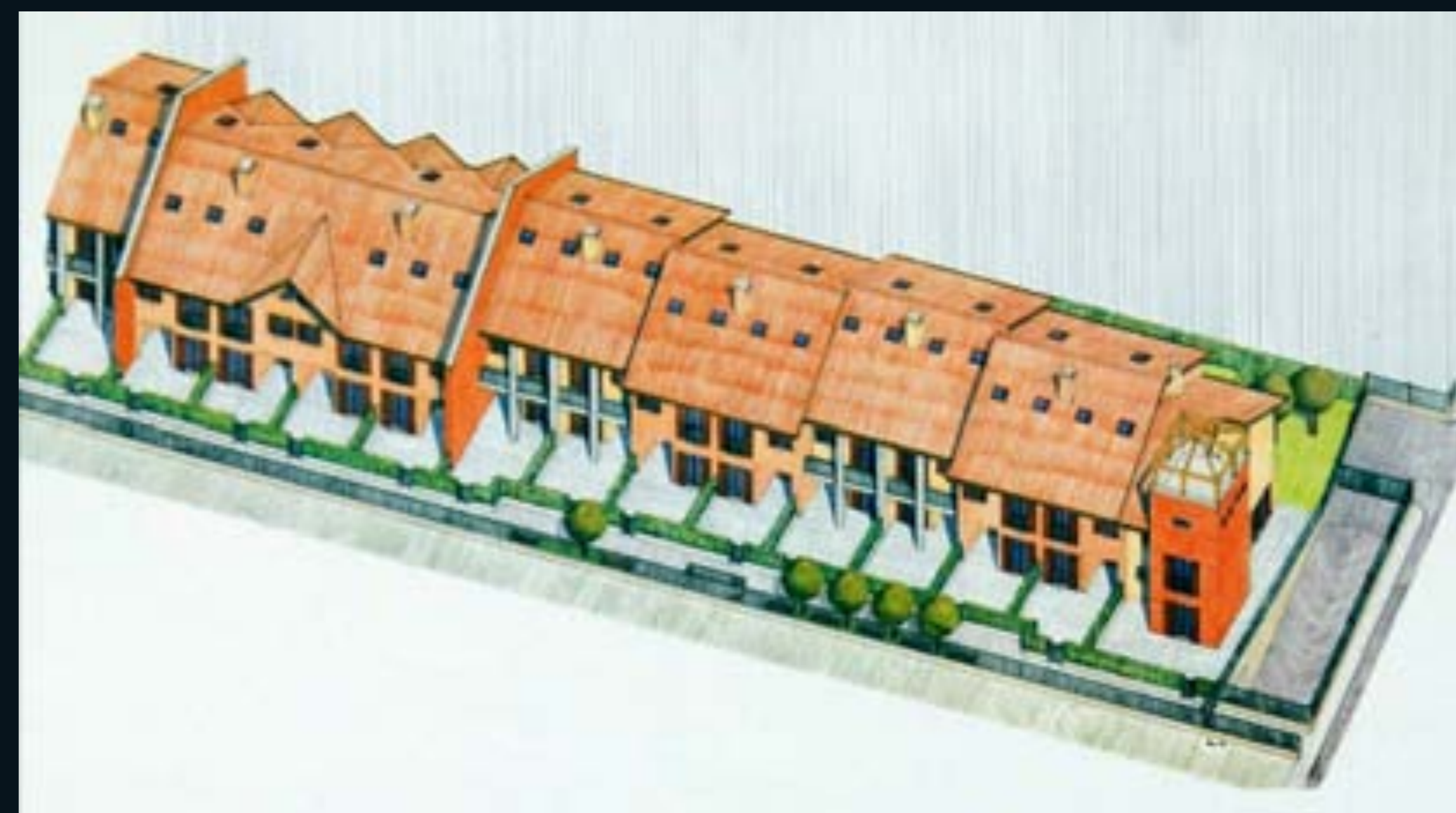
Vista assonometrica lato ovest