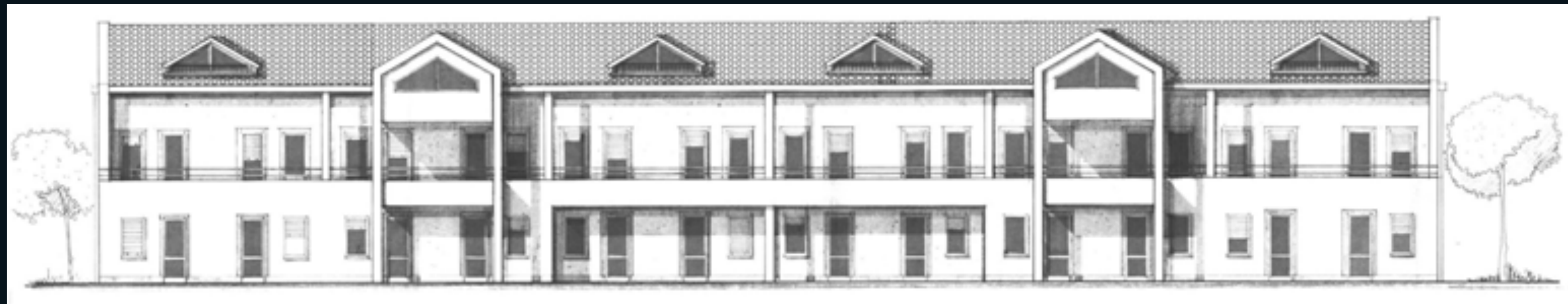
Prospetto su via Chiesa